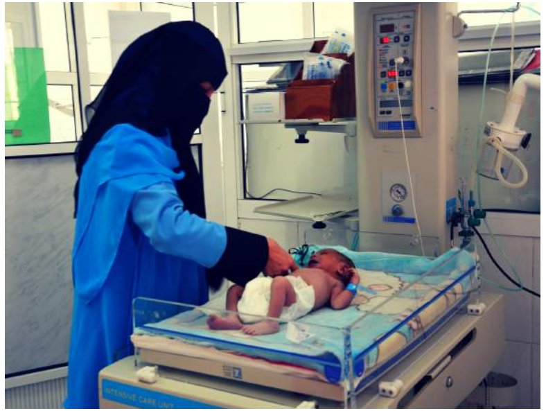
UNFPA supported maternity ward in Ibb