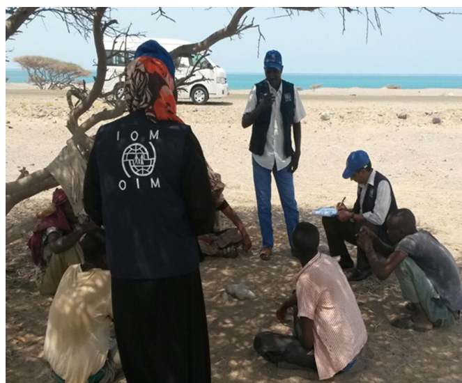
Migrants being interviewed by IOM upon arrival