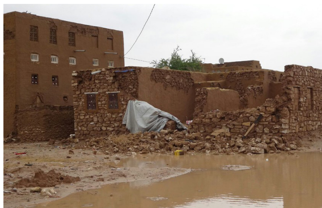
Cyclone Sagar caused limited damage to infrastructure in the southern coastal area of Yemen.

In Hadramaut Governorate, the rains cut off some roads and damaged electricity infrastructure. The Shelter/NFI/CCCM Cluster reported localized damage to houses in Mayfa'a and Brom, near Al Mukalla District. The need for support is being assessed; cluster partners are concerned that floods could further spread cholera in the weeks ahead.